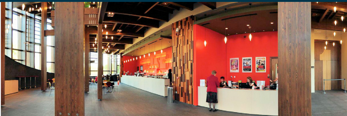
Foyer: Box Office and Waterside café.