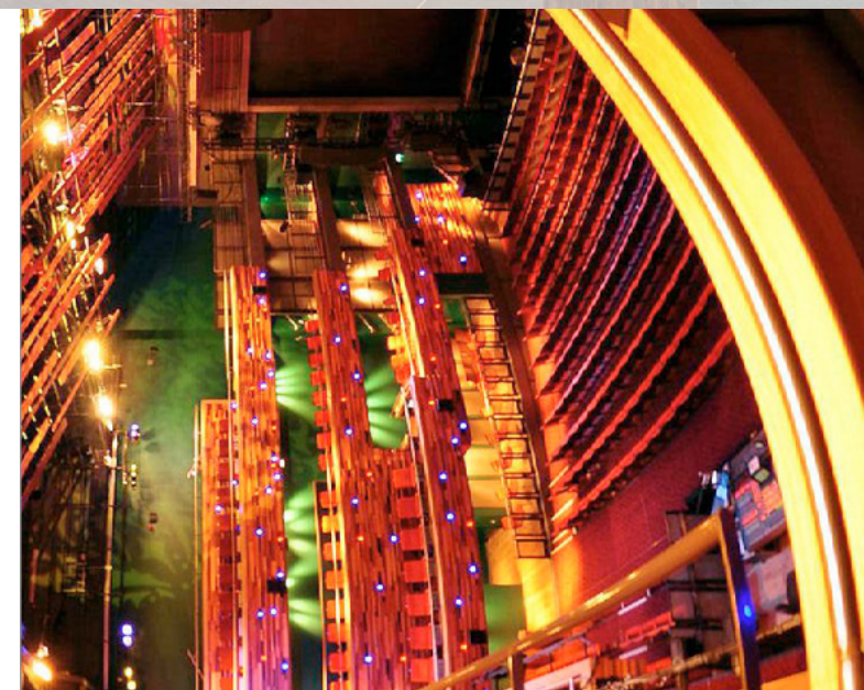
Main auditorium, made out of 100,000 pieces of wood.