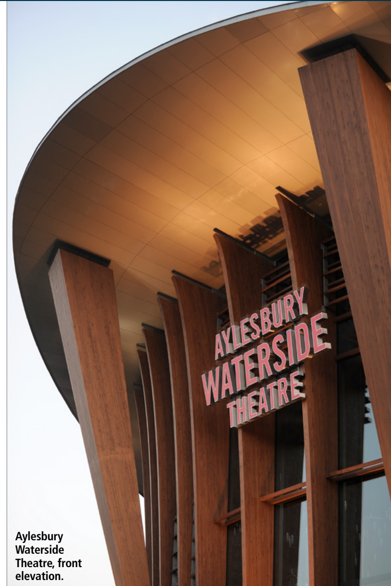
Aylesbury Waterside Theatre, front elevation.